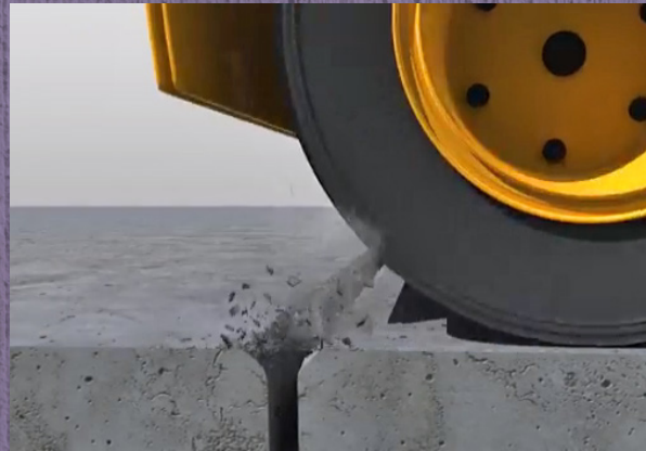
A non-protected concrete joint is subject to impact damage.